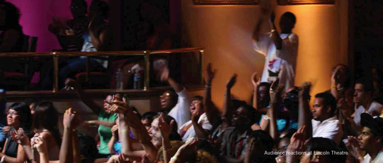
Audience reactions at Lincoln Theatre